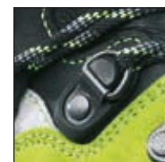
HAIX® 2-Zone Lacing