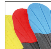
HAIX® Vario Wide Fit System