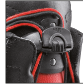
HAIX® FL Fit System