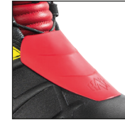
HAIX® 3Z Protector System