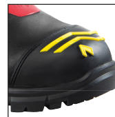
HAIX® High Durability Cap System